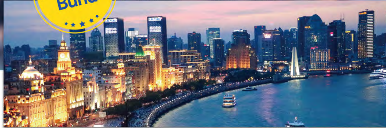
52 Classic Buildings of Gothic and Baroque Styles to showcase Shanghai's history the largest, most exciting port city in East Asia.