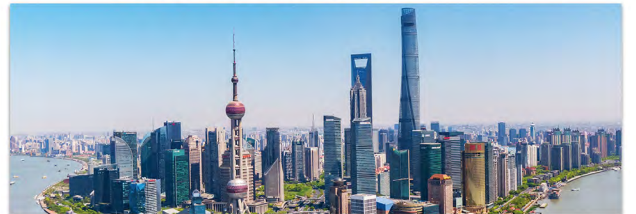
The largest financial zone in mainland China, a great place to experience the modern flavor of this metropolis.