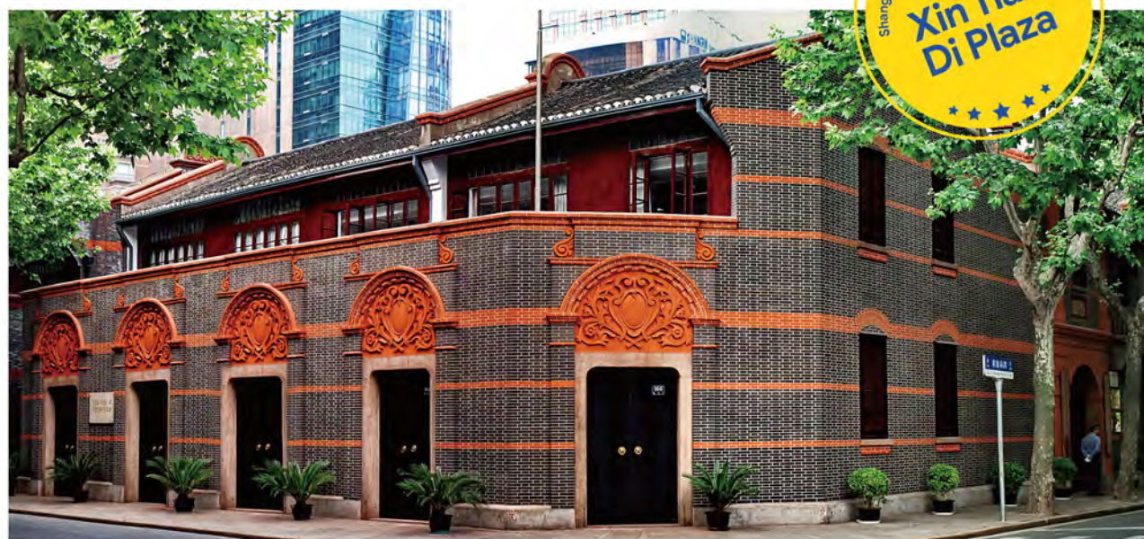
An ideal urban place for tourists to appreciate historical and cultural legacies of Shanghai