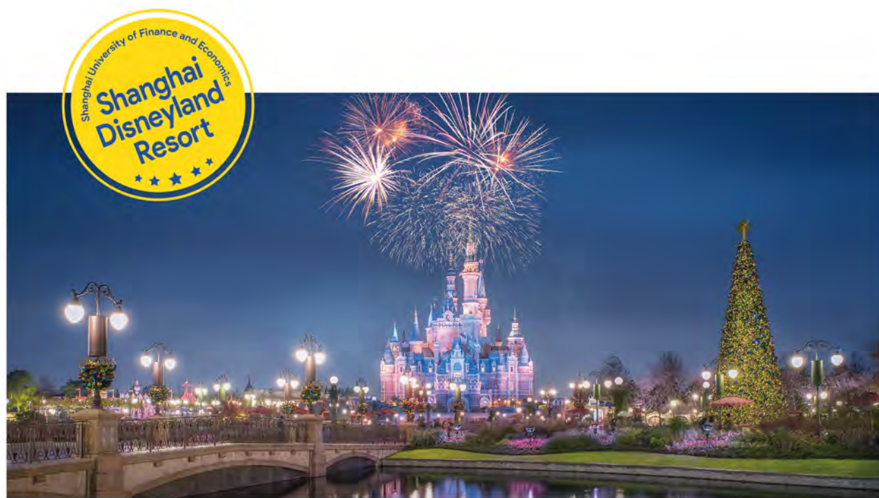
Set your sights on Enchanted Storybook Castle—the largest Disney castle on the planet.