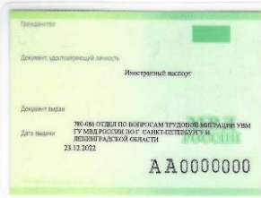
dactyloscopy ID card example