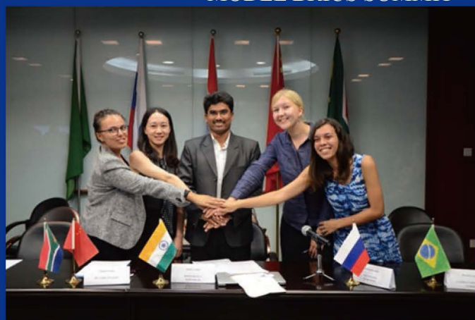
MODEL BRICS SUMMIT