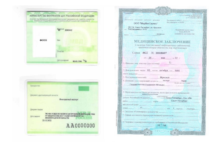
dactyloscopy ID card example

STEP 4: Send the scanned copies of your medical certificates and plastic ID in pdf-format to migrationspb@hse.ru and always keep it with you just like your passport, migration card, and registration